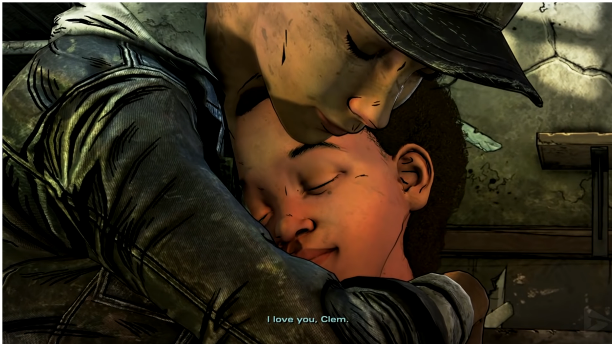
Figure 6. Clem and AJ share a tender moment. Screenshot taken from The Walking Dead: The Final Season

Importantly, although there is a lot of violent action in the final season, there are also several moments of teaching, caretaking, and tenderness between Clem and AJ. For example, AJ asks Clem how to get rid of his trauma, admits how terrified he is of losing her, and they say “I love you” to each other and hug (see Figure 6 ). These moments echo the interactions between Lee and Clem in S1 and send the message that Clem is a good mother, just as Lee was a good father.