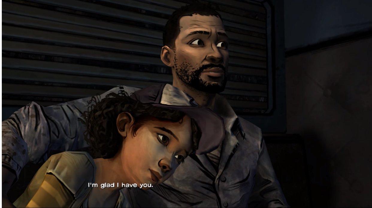
Figure 2: Lee and Clem. Screenshot taken from The Walking Dead: Season One