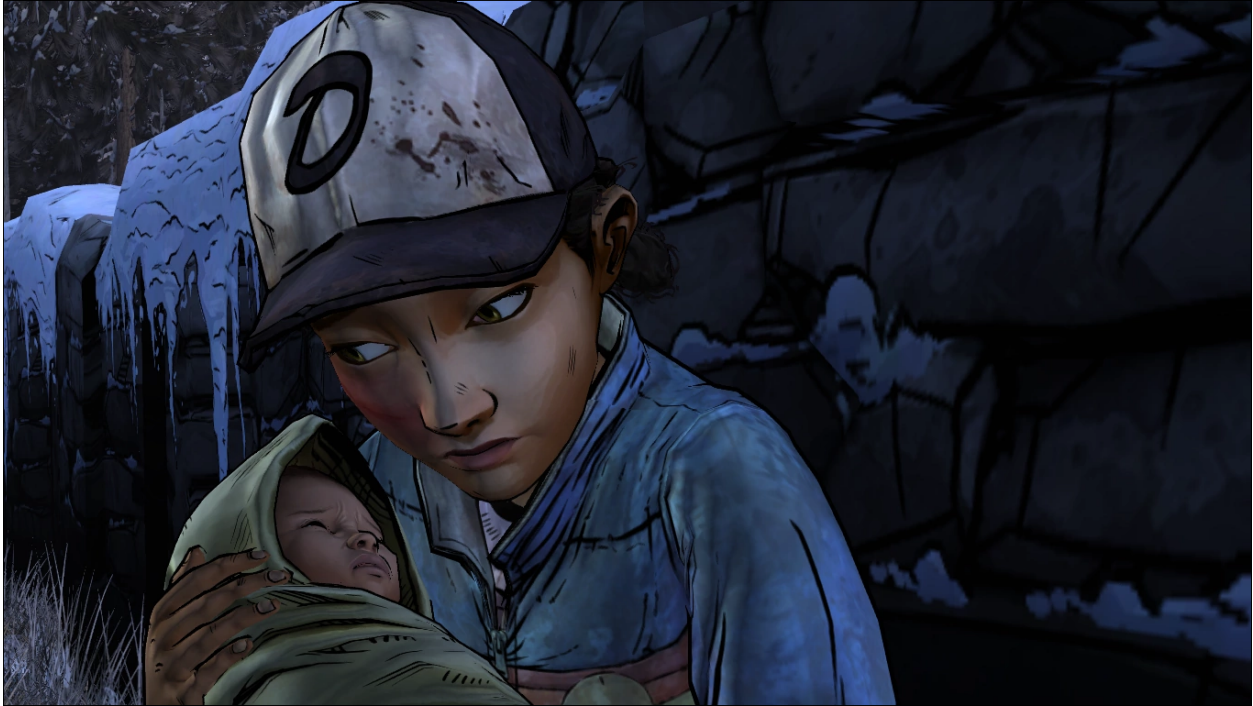
Figure 3: Clem and AJ. Screenshot taken from The Walking Dead: Season Two

giving him another chance at fatherhood. 2 He admits that he failed to raise his late son like he should have and vows not to make the same mistakes raising AJ. However, following Kenny's death later in the episode, Clem becomes AJ's sole parent.