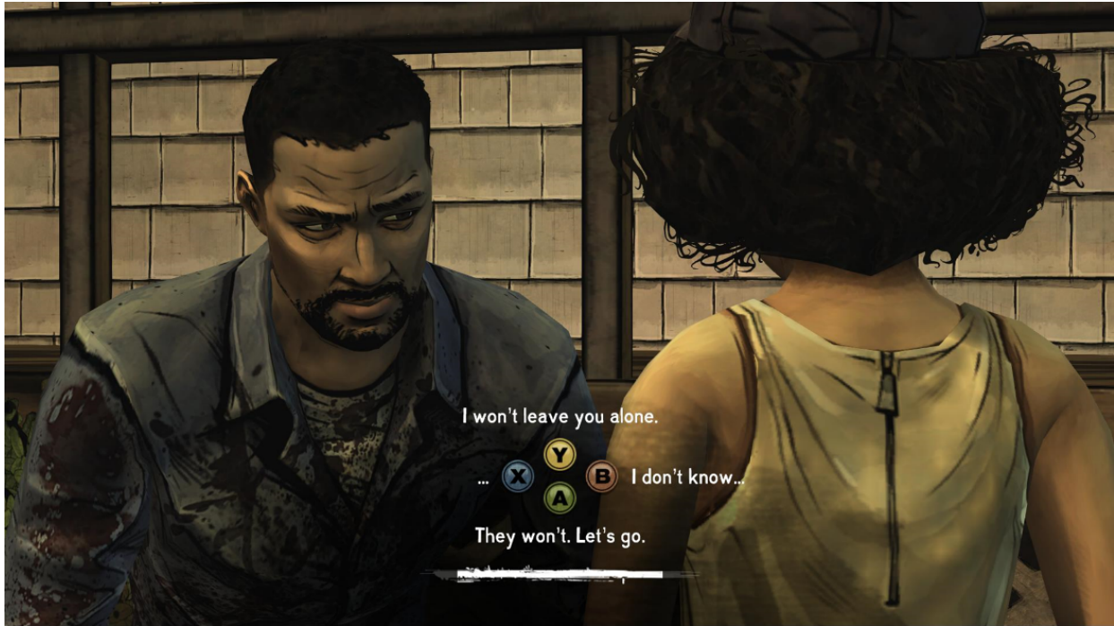
Figure 1: Lee and Clem. Screenshot taken from The Walking Dead: Season One