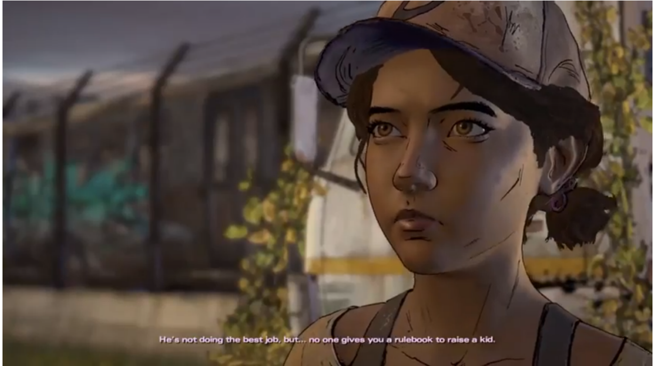
Figure 4: Clem. Screenshot taken from The Walking Dead: A New Frontier

Another example occurs in a conversation between Clem and Javi: although Javi is not a father-figure for Clem, he is tasked with explaining menstruation to her in one memorable scene. Clem knows that it is normal, but no one ever explained to her what it means, so the player can choose for Javi to tell her that her body is changing and that it means she could become a mom if she wanted. This moment of care is reminiscent of the way Lee interacted with Clem when he cut her hair – slightly awkward due to stereotypical masculine discomfort with feminine topics but enacted with kindness and honesty. However, the most notable element in this scene is Clem’s reaction to Javi’s explanation: “Funny. I already felt like a mom. Kenny used to say I was a natural-born mother” (S3; see Figure 5 ). This statement is followed by a flashback in which players see Clem, Kenny, and AJ around a campfire. Kenny tells Clem that she’s the only “mama” that AJ has, and that she is “protective, loving, caring... All the things a good parent needs to be and all at your age” (S3). Clem already felt like a mother, regardless of her reproductive biological functions and age, and she believed, and was told, that she was good at it.