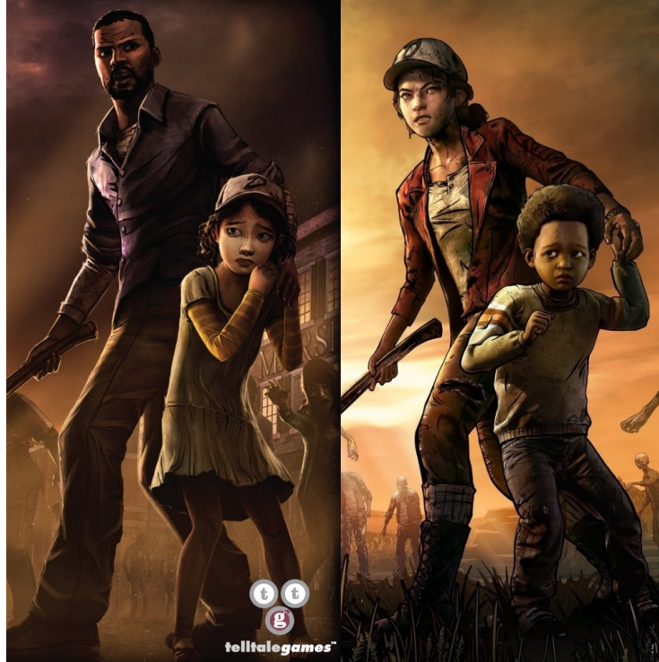
Figure 7: Screenshots of the cover art from The Walking Dead: Season One and The Walking Dead: The Final Season