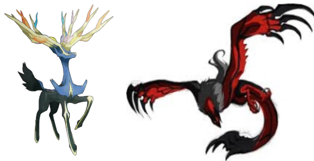
Figure 1: Xerneas and Yveltal. This figure illustrates the two, primary exclusive creatures that differentiate Pokémon X and Y. Xerneas is on the left, Yveltal is on the right.

Pokémon X/Y was developed by Game Freak, published by Nintendo and was released worldwide, for the Nintendo 3DS on October 12, 2013. Pokémon X and Pokémon Y are sold as two distinct games, as has been the tradition in the series since the first set of games, subtitled Blue and Red in North America, was released in 1998. Despite this fact, I will be talking about X and Y as a single game primarily due to the fact that they are fundamentally the same game. The only difference between the two involves the inclusion of exclusive creatures. X is named for the legendary, fairy-type creature called Xerneas, and Y for the legendary, dark, flying-type creature called Yveltal (see figure 1 ). There are also different special powers and forms available for high level creatures depending on which version of the game the player has.