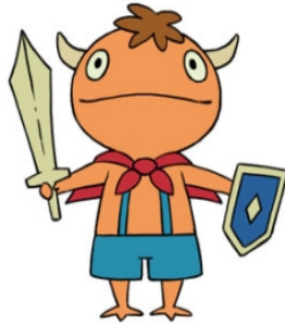
Figure 3: Mite. This figure shows an image of the starting familiar from Ni No Kuni, called a Mite.

of Fantasy in Ni No Kuni 9 .” What is important here is that Oliver is aided in his quest by a variety of creatures called familiars. As noted above, Oliver starts out with one creature, called a "Mite" (see figure 3 ), with whom he completes the first portion of his quest.