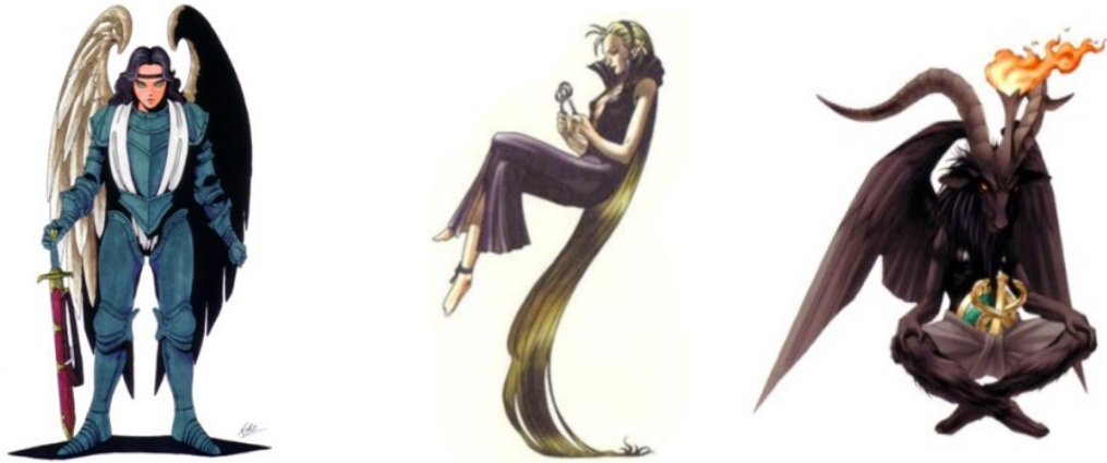
Figure 4: Three Demons. This figure shows three examples of the demons that can be collected in Shin Megami Tensei IV . Archangel on the left, Leanan Sidhe in the centre, and Baphomet on the right.

Although most of the demons are not considered to be "cute", they still have many of the elements that are associated with triggering feelings of moe. What makes them stand apart even more however, is the fact that the majority of them are linked to mythological creatures from around the world. Unlike the creatures in the other two games, these creatures have strong connections to already existing narratives and cultural traditions. This use of familiar names and characters has the potential to increase the level of attachment to certain creatures based on the real-life experiences of the player.