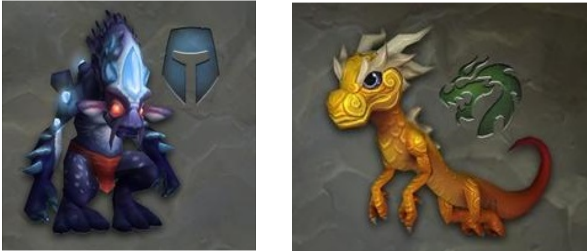
Figure 5: World of Warcraft Battle Pets. This figure shows two different types of battle pets, a humanoid pictured on the left, and a dragonkin on the right.