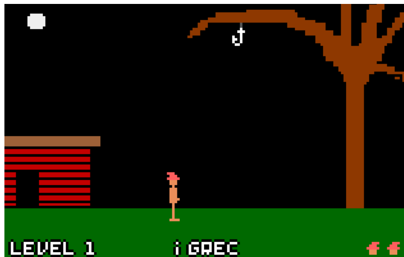
Figure 1: Tuque Rose (I-Grec 1999)

I-Grec’s corpus is released between 1996 and 1999 when the prominent video game paradigm remains “in your face” innovation: more megabytes, more pixels, more polygons, more networking, more enemies, more guns, more sound, etc. His own approach is rather anchored in a retrospective ludophilia. The themes, genre and aesthetics of his games both parody and pay homage to older classics. I-Grec’s Atari inspired work (see Figure 1) foreshadows current indie developers’ fascination with NES and SNES 8-bit aesthetics and mechanics. Judging from this progression, we can safely predict a soon to come passion for lo-fi Nintendo64 polygonal graphics in indie games.