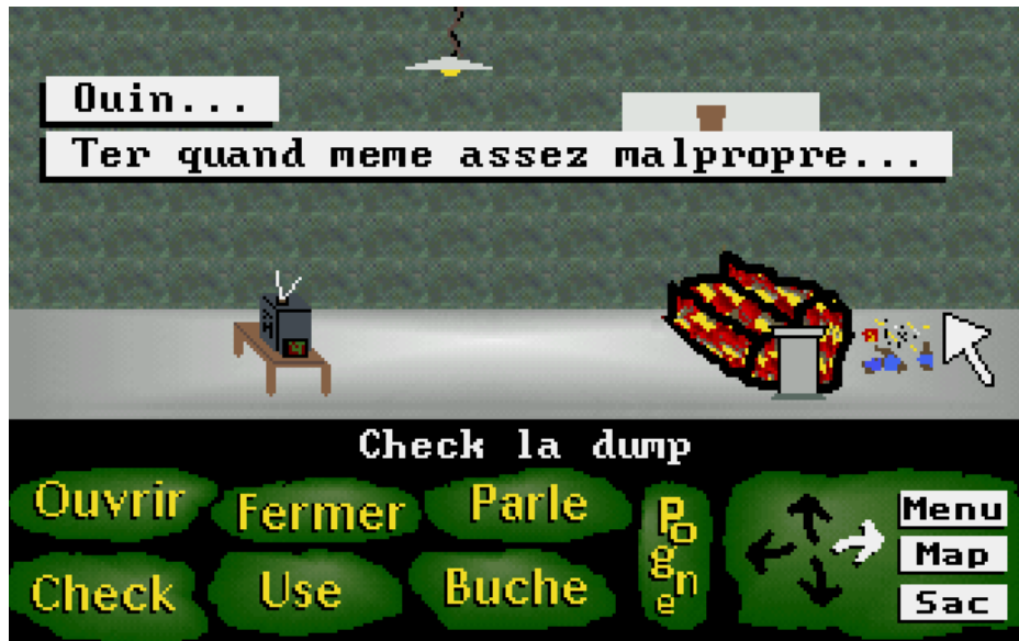
Figure 2: Tabarnak (I-Grec 1998)

screen might not be perfectly comprehensible to one only used to standard French but are hilarious to those familiar with Quebecois French.