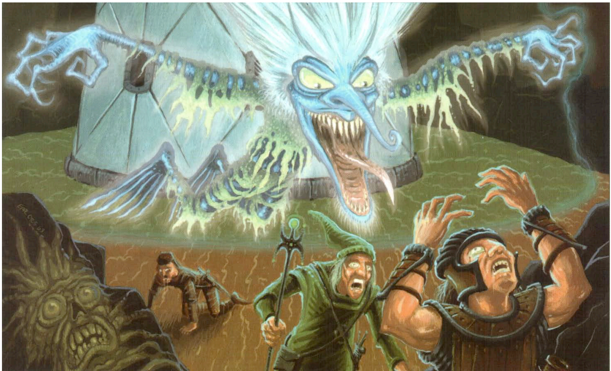
Figure 4: Goodman, Joseph. (2003). DCC#3 The Mysterious Tower . Chicago: Goodman Games.