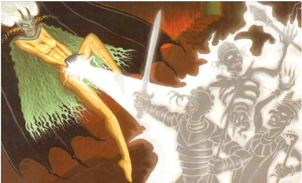
Figure 8: Doyle, C., et al. DCC#13 Crypt of the Devil Lich . Chicago: Goodman Games.