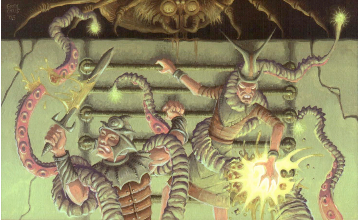
Figure 5: Crow, J. (2004). DCC#4 Bloody Jack's Gold . Chicago: Goodman Games.