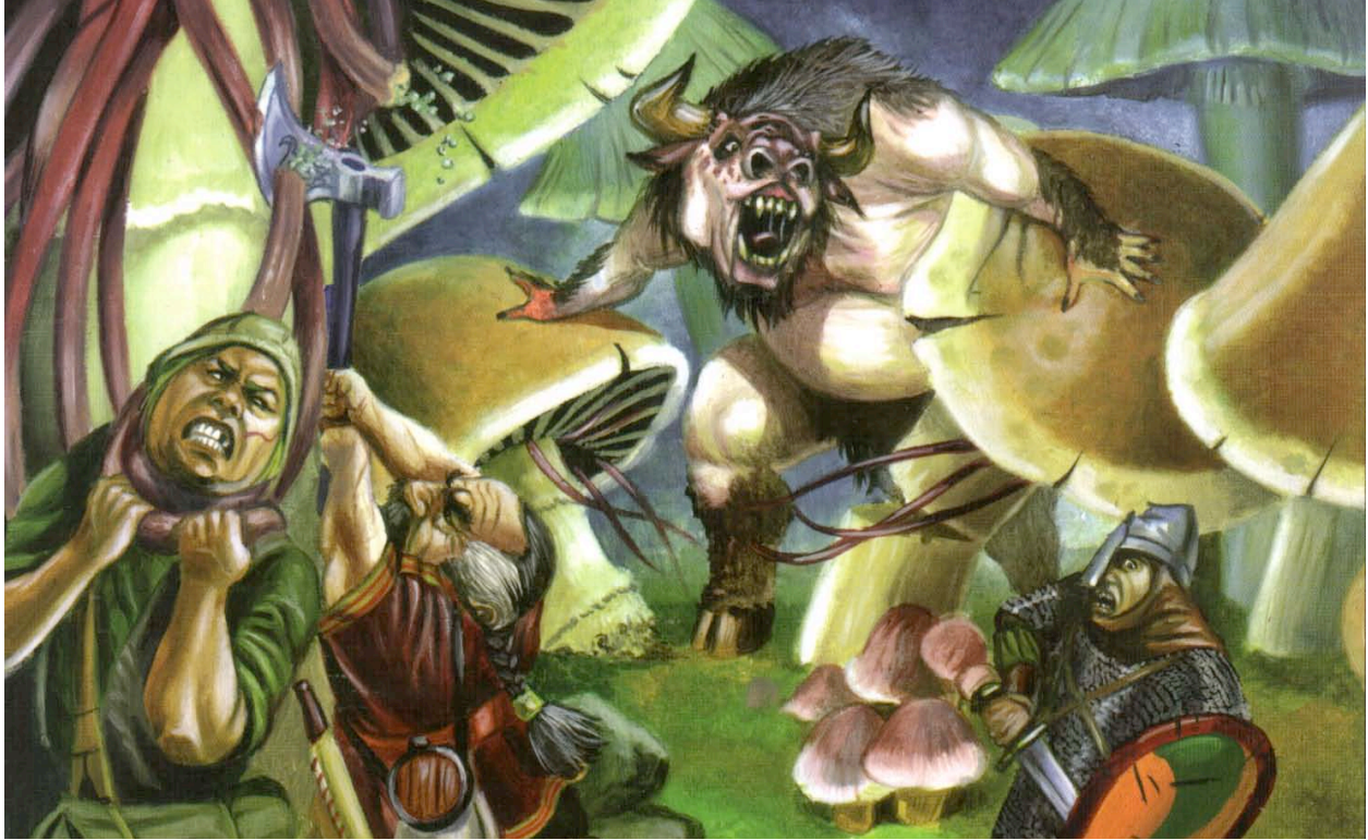
Figure 11: Stiles, C. (2004). DCC#21 Assault on Stormbringer Castle. Chicago: Goodman Games.