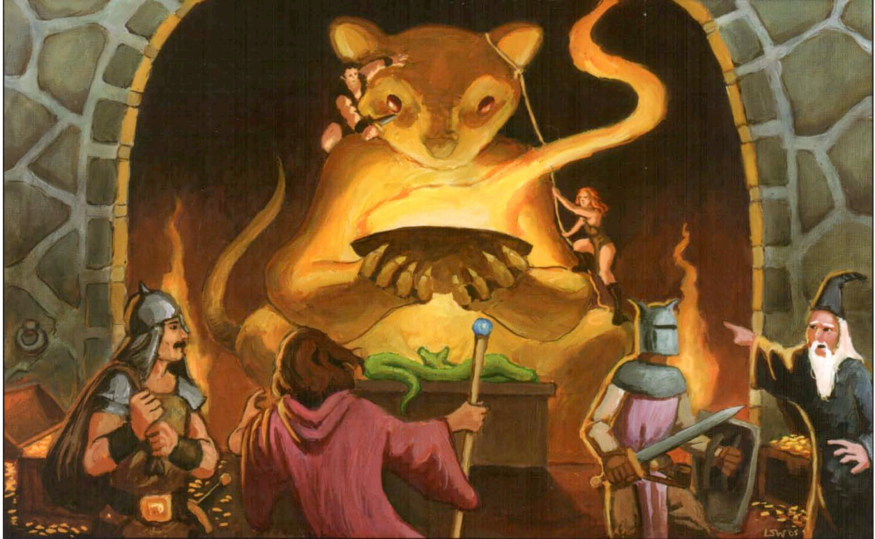
Figure 3: Stroh, H. (2006). DCC#27 Revenge of the Rat King . Chicago: Goodman Games.