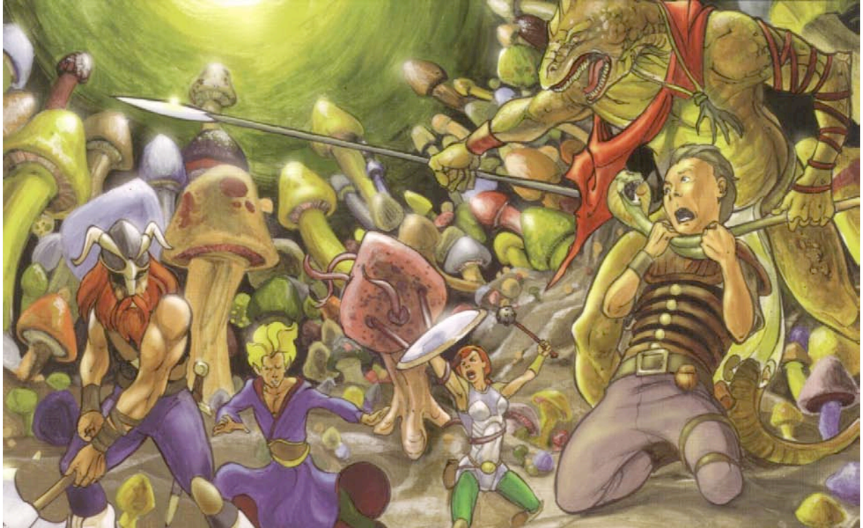
Figure 19: Maffei, R. (2002). DCC#26 The Scaly God . Chicago: Goodman Games.