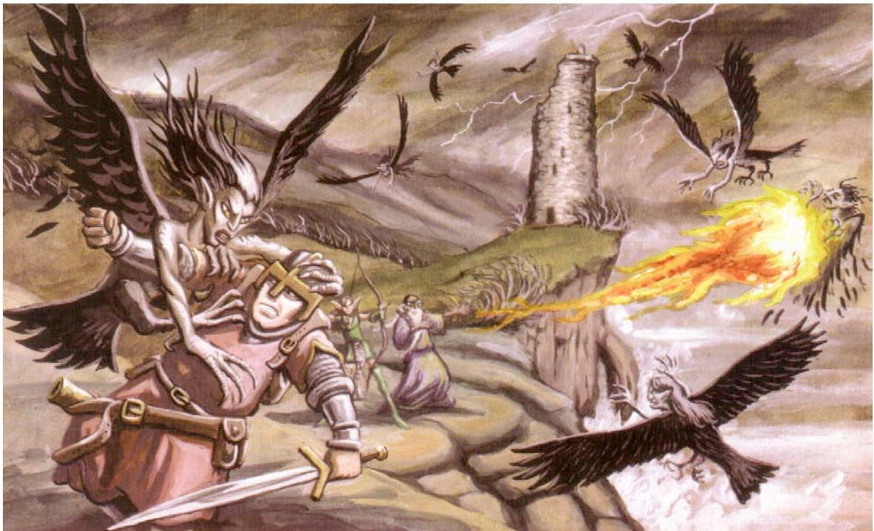
Figure 12: Hind, A. (2004). Aerie of the Crow God. Chicago: Goodman Games.