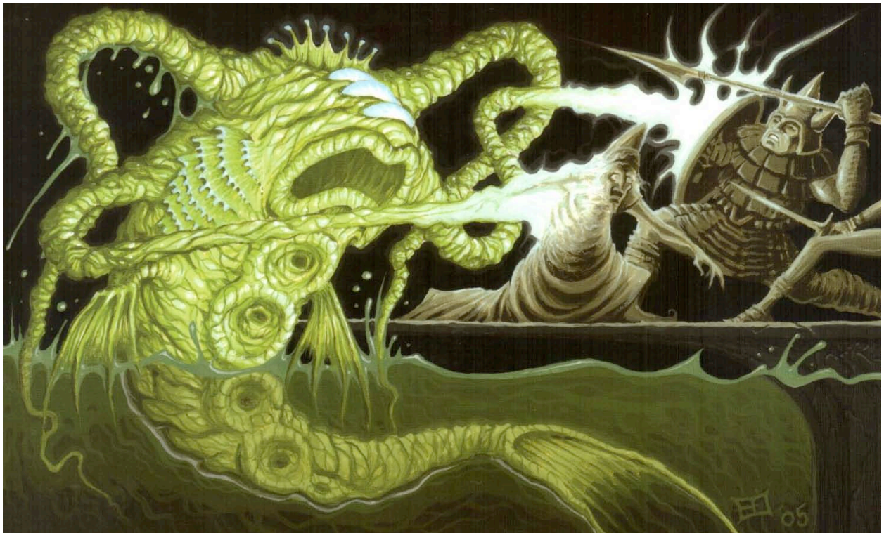
Figure 6: Simmons, J. (2006). DCC#25 The Dread Crypt of Srihoz . Chicago: Goodman Games.