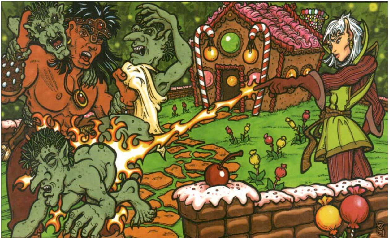
Figure 20: Greer, S. (2006). DCC#38 Escape from the Forest of Lanterns . Chicago: Goodman Games.