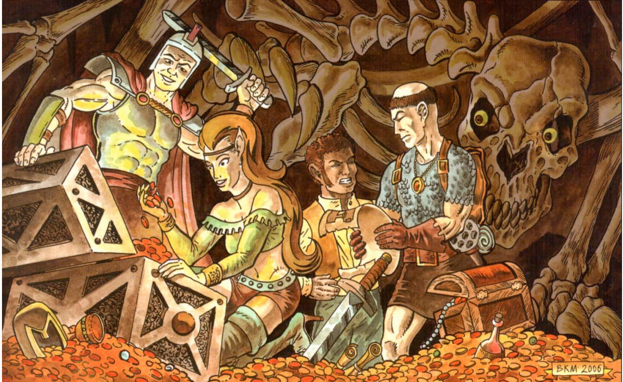
Figure 15: Rudel, A., et al., Eds., (2007). DCC#46 The Book of Treasure Maps . Chicago: Goodman Games.