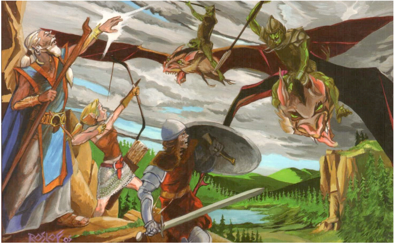
Figure 9: Stroh, H. (2006). DCC #28 Into the Wilds . Chicago: Goodman Games.