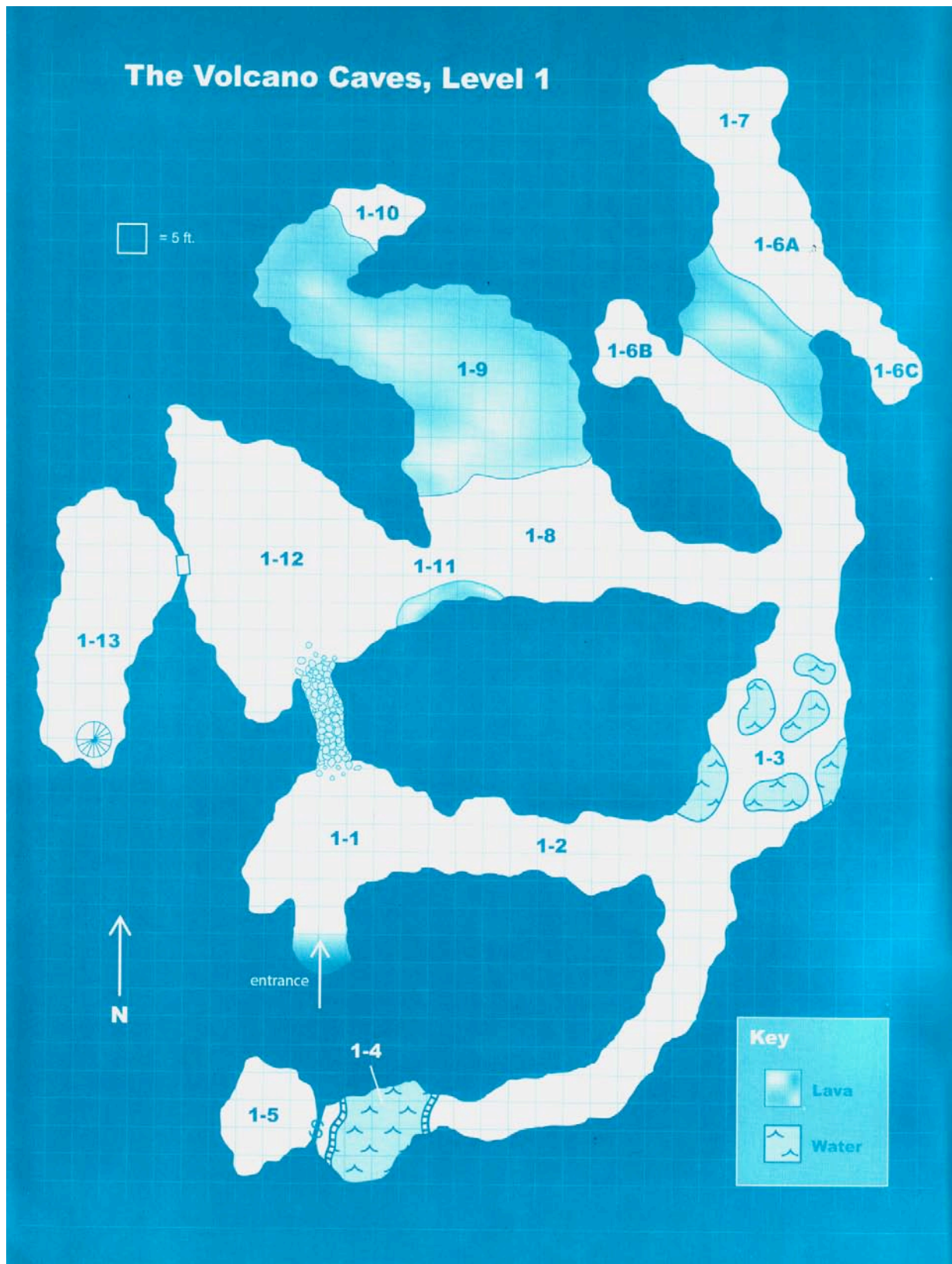
Figure 2: Johnson, L. (2005). The Volcano Caves . Chicago: Goodman Games.