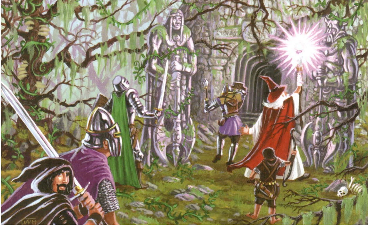
Figure 17: Stroh, H. (2005). DCC#17 Legacy of the Savage Kings . Chicago: Goodman Games.