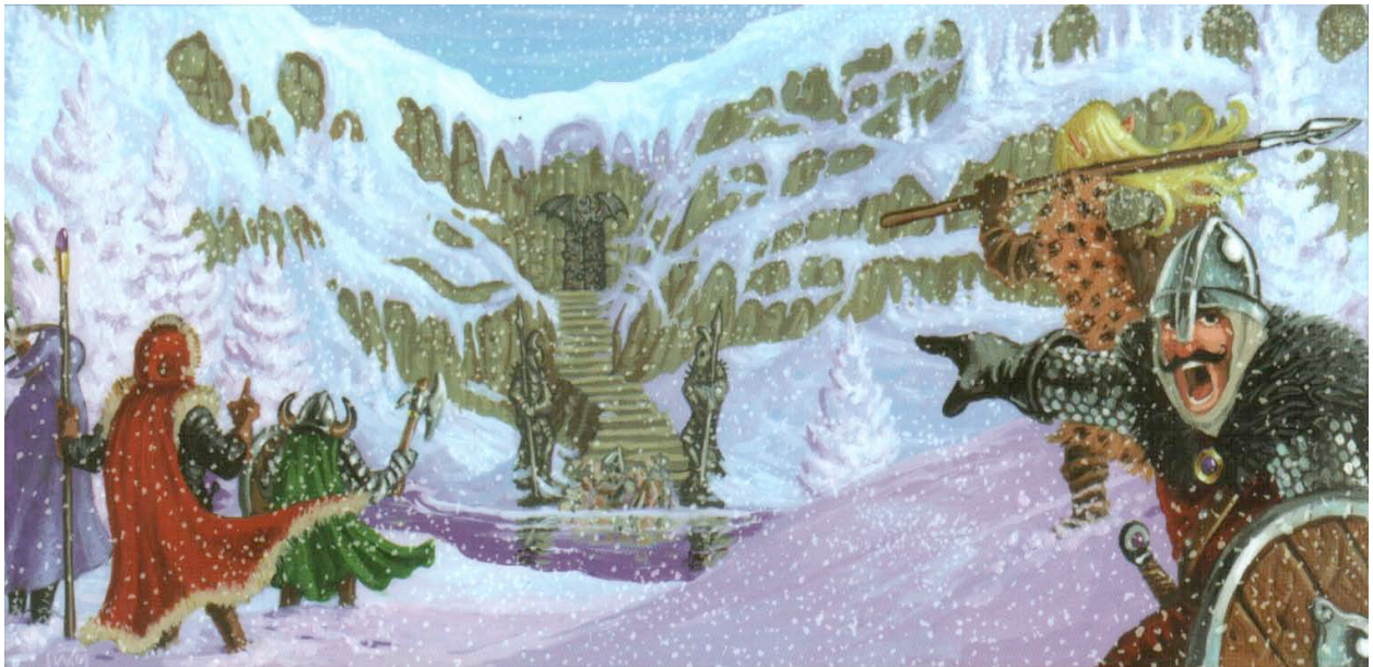
Figure 18: Stroh, H. (2005). DCC#12.5 The Iron Crypt of the Heretics . Chicago: Goodman Games.