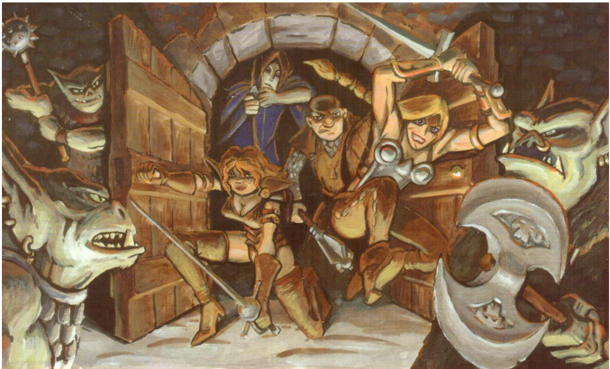
Figure 16: Doyle C. and Pommier, A. (2007). DCC#50 Castle Whiterock . Chicago: Goodman Games.