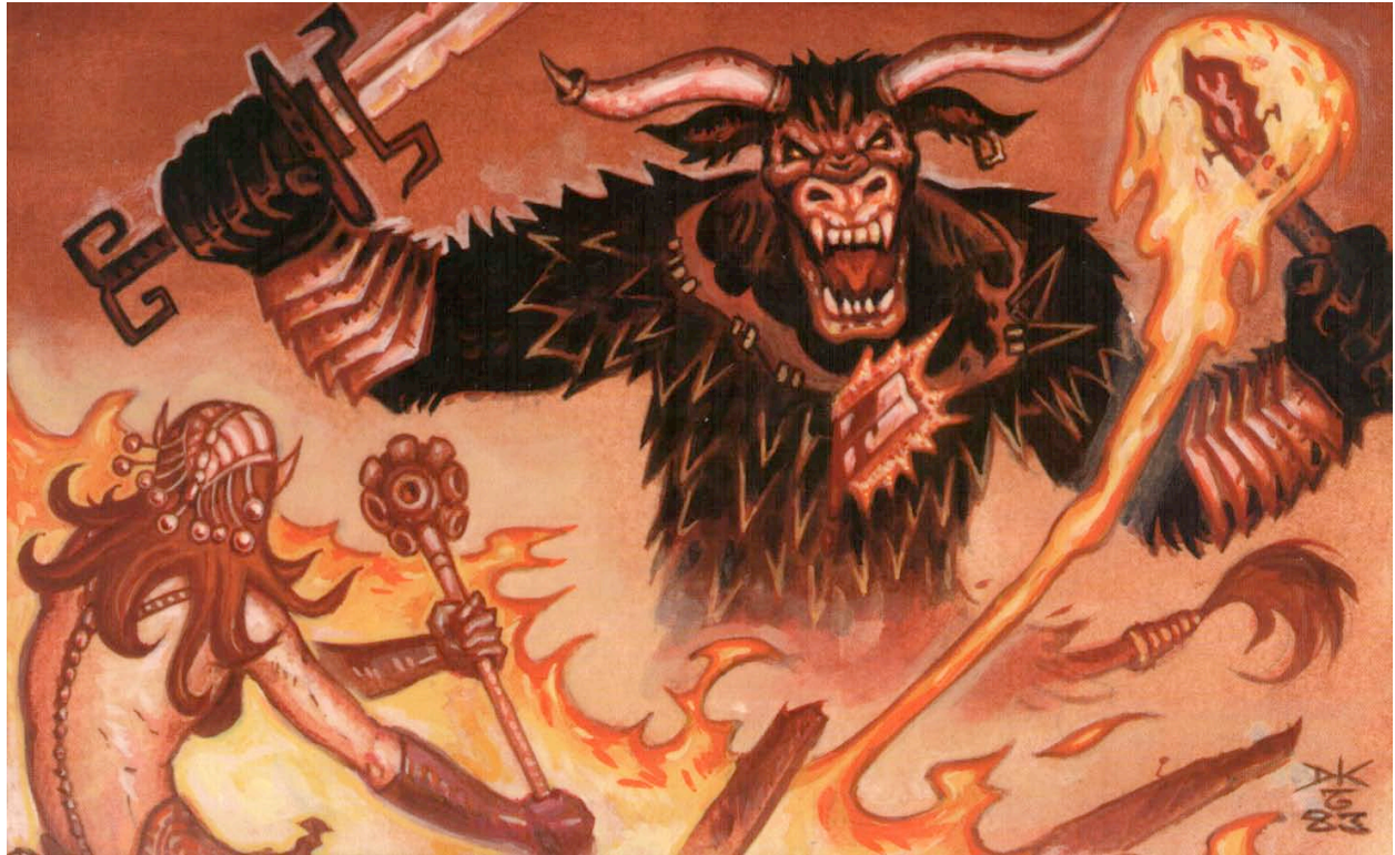
Figure 13: Stroh, H. (2006). DCC#35A Halls of the Minotaur . Chicago: Goodman Games.