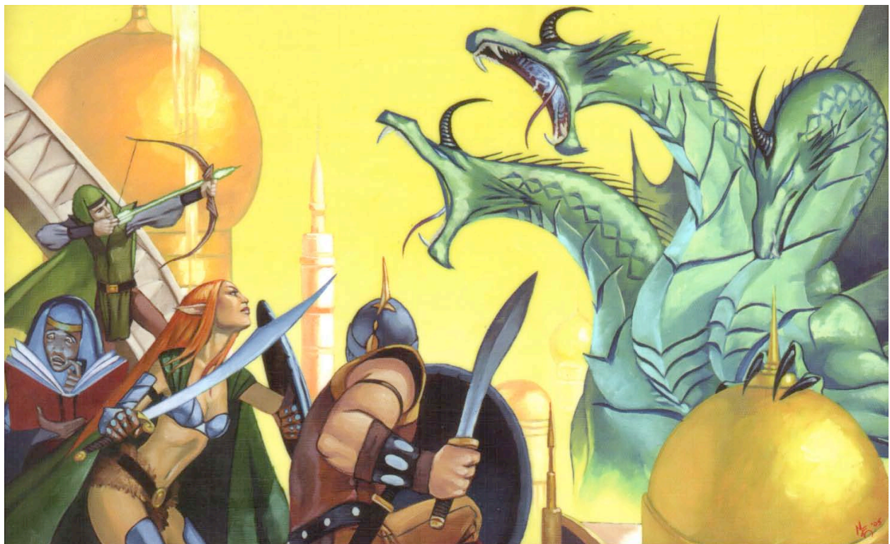
Figure 14: Oppedisano, G. (2006). DCC#32 The Golden Palace of Zahadran . Chicago: Goodman Games.